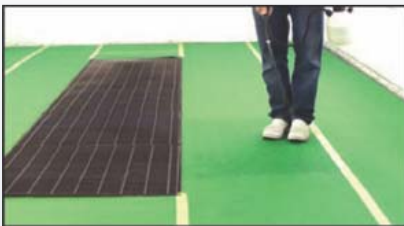
Mist daily with Particle Control