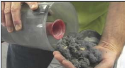
Typical amount of dirt removed daily

Warning! Do not install or remove the mat, or vacuum the mat or bare floor when explosive concentrations of flammable materials are present, as static discharge may occur during these activities. Always ventilate spray booth completely to remove any ignitable vapors and dust prior to these activities.