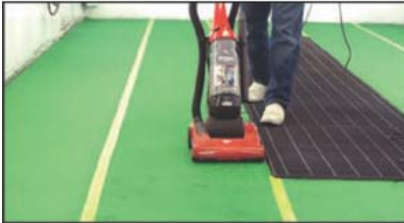
Vacuum daily 1 to remove contaminants