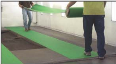
Fast installation in less than 30 min.