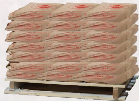
Pallet = 40 bags