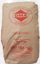
Bag = 55 lb