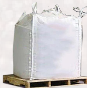
Super bag = 2,000 lb