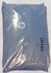
Bag = 55 lb