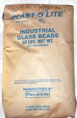
Bags = 50 lb