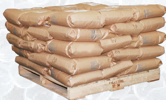
Pallet = 40 bags