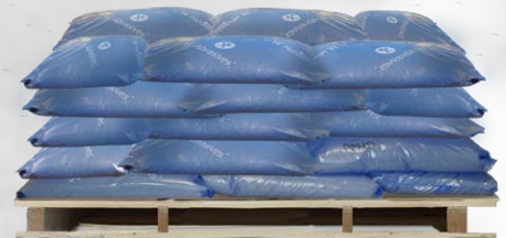
Pallet = 40 bags