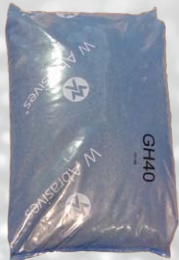
Bag = 55 lb