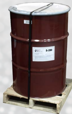
Drum = 1,700 lb