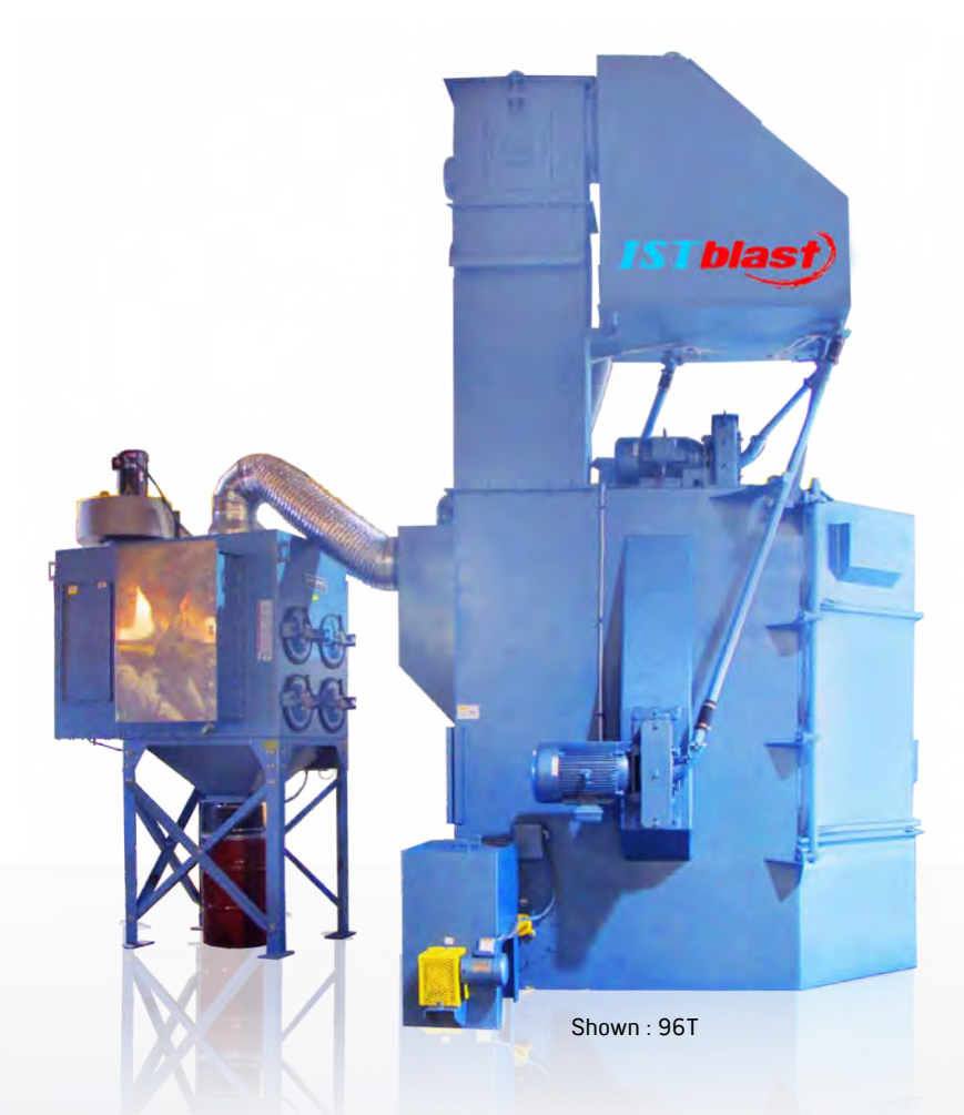
TABLE BLAST SYSTEMS SERIE 36 to 96T

ISTblast Table Blast models are the ideal choice for a wide variety of parts that are not suitable for tumbling due to size and shape.