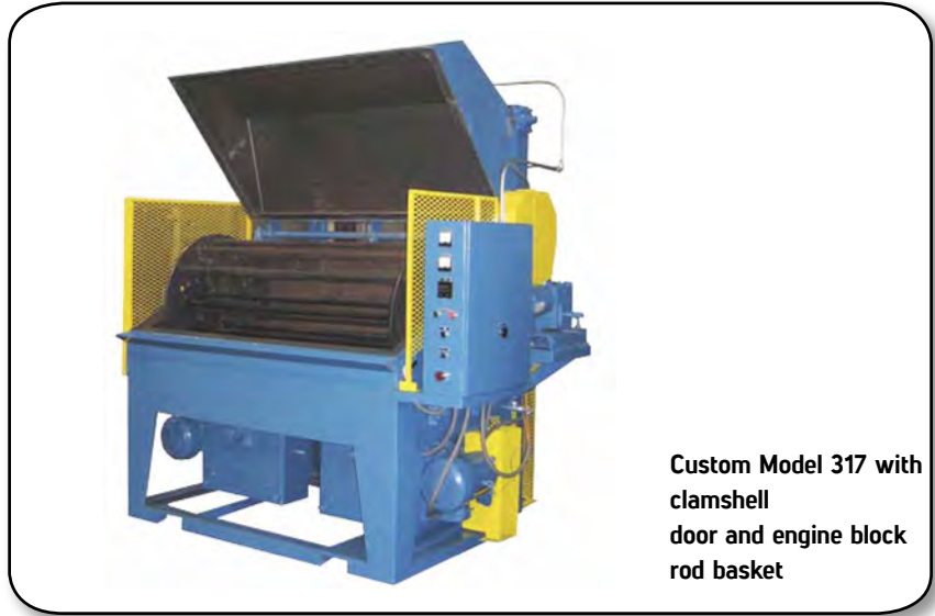
Custom Model 317 with clamshell door and engine block rod basket

With an accomplished and proven design staff, ISTblast can build equipment from the ground up or simply modify existing models to tailor fit your cleaning application.