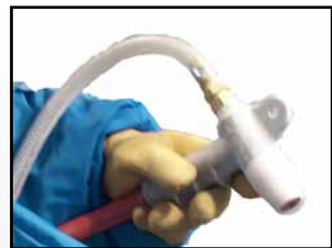
Extra gun for manual cleaning.