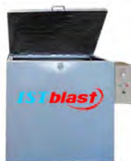
Model 4 S