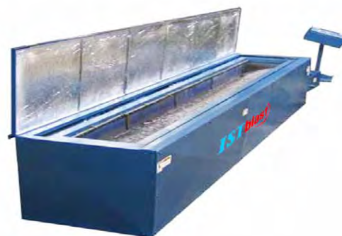
Model 72 S