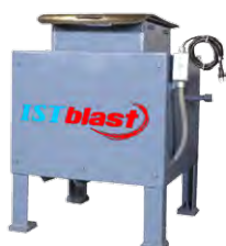
Model 2 S

ISTpure OFFERS A FULL LINE OF vibratory tubs , like :