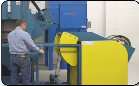
Pneumatic Loading System