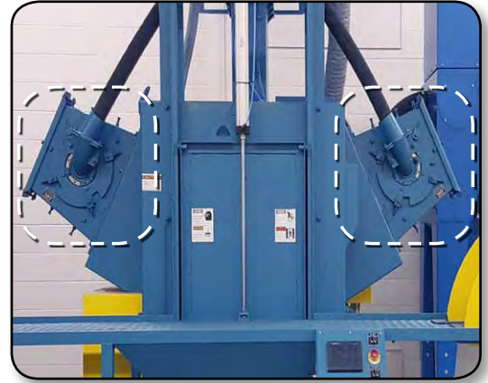
Two VK PowerMax Blast Wheels