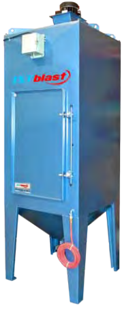
Powerful DCM Series Motorized Dust Collector