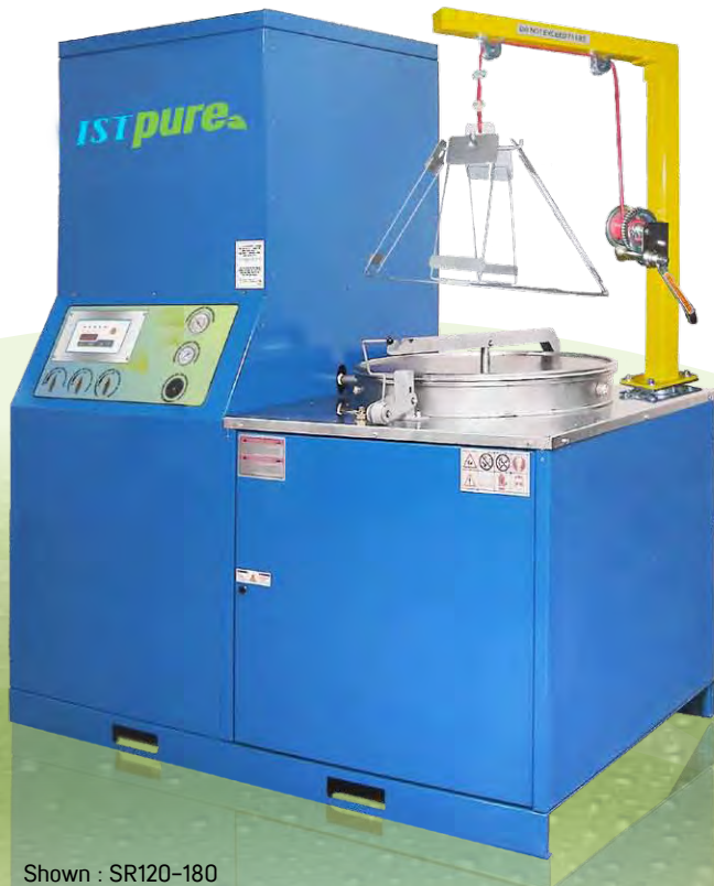
Shown : SR120-180