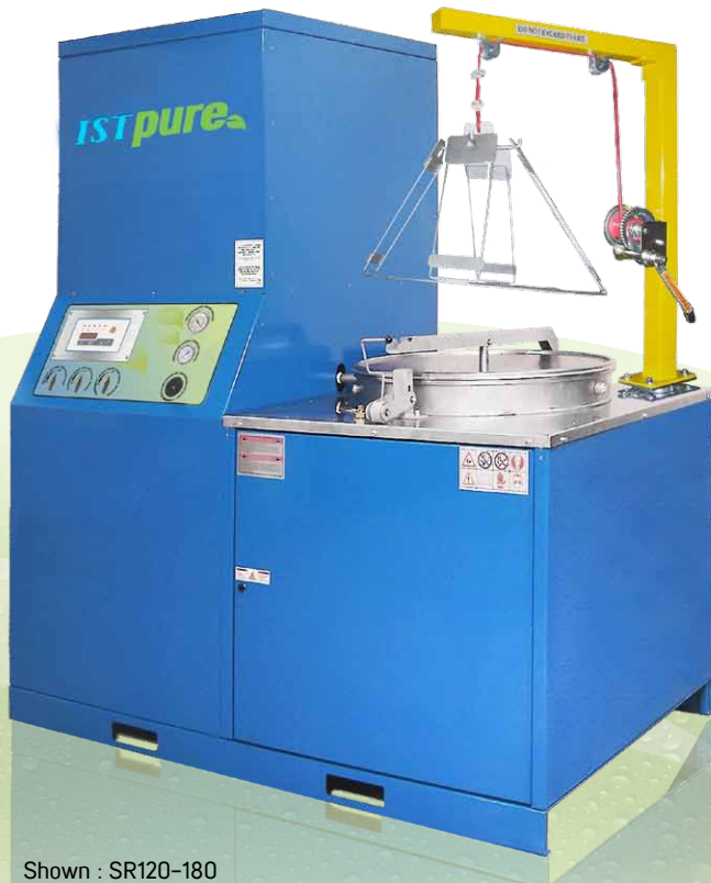
Shown : SR120-180

Large capacity solvent recyclers are suitable for industrial enterprises with a consumption volume equivalent to about 240 liters per day or less. These units are ultra-compact and are equipped with explosion-proof devices. They can therefore be installed easily in a location that allows this type of equipment and can be used on a daily basis.