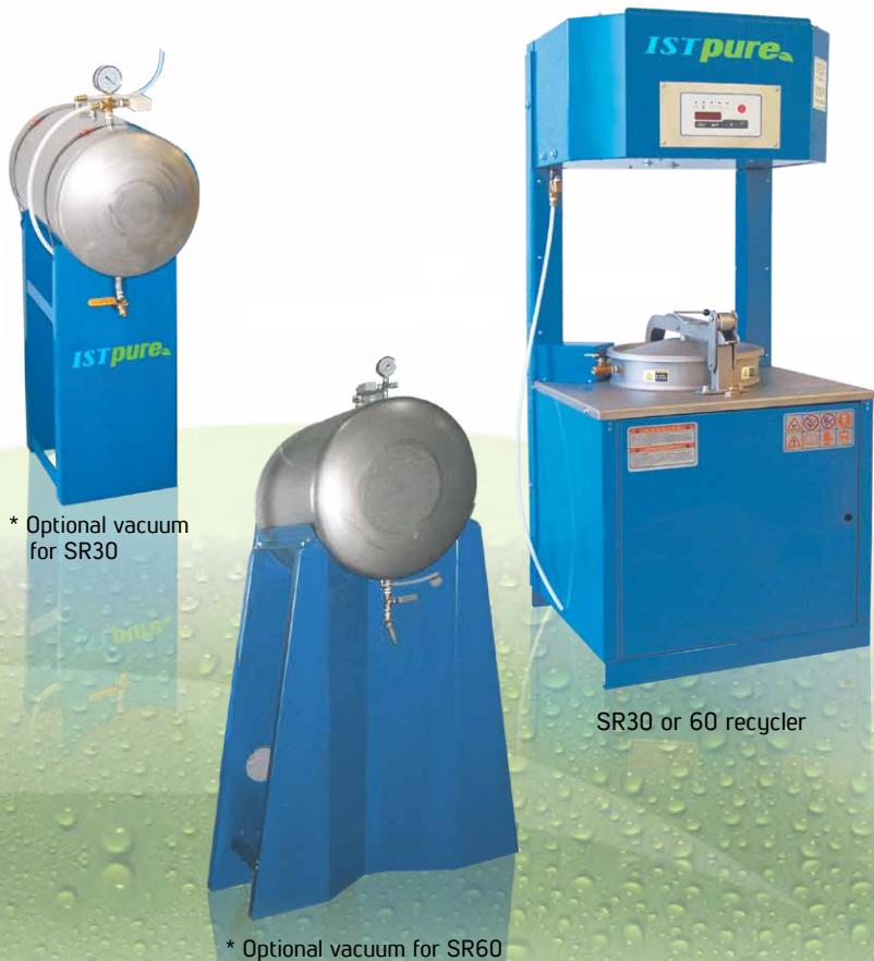
* Optional vacuum for SR30