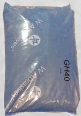
Bag = 55 lb