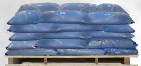
Pallet = 40 bags