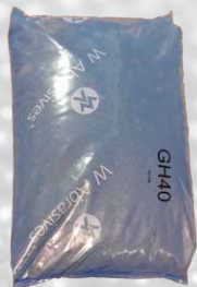
Bag = 55 lb