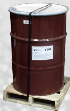
Drum = 1,700 lb