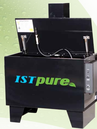
For use with mineral spirits based solvents with a flash point greater than 40° C (104° F).

The AL Series Solvent system is built with heavy-duty steel construction coated with baked epoxy-powder finish. An optional stainless steel construction and finish is available for long-lasting durability.