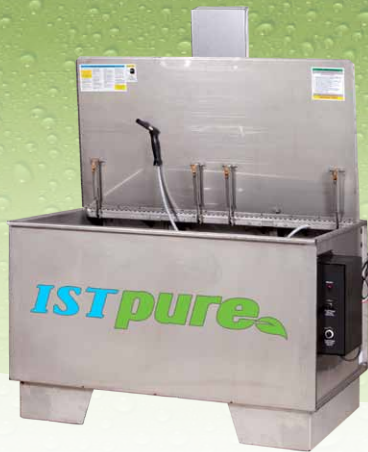
For use with aqueous-based

The AW Series Aqueous system is built with 12-gauge stainless steel construction. It features 6,000 watt heating elements with thermostat preset and backup thermostat (non-adjustable) that can heat cleaning fluid up to 110°F (43°C) for better cleaning action. The thermostat can run plus or minus 4 °F.