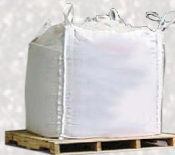
Super Bag = 3,100 lb