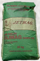
Bag = 55 lb