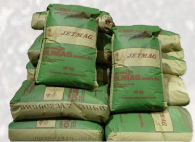
Pallet = 56 bags