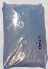
Bag = 55 lb