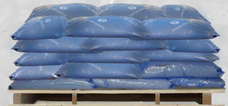
Pallet = 40 bags