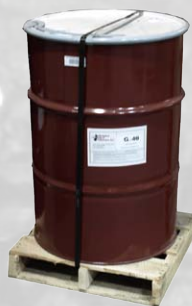
Drum = 1,700 lb