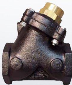
Automatic Air Valve

Maxblast upgrade kit includes an automatic air valve and connectors to fit a 1½" blast hose which increases air pressure at the nozzle, reduces pressure losses and increases operator's productivity.