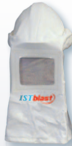
Protective hood # 603033