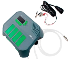
GX4 Gas Monitor