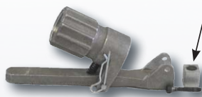
RCM-12 Remote Control # 602007