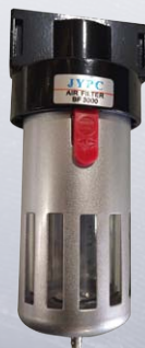
Dehumidifier filter # 601119