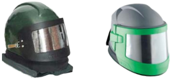
Breathable protective hoods (Nova 2000 & Nova 3)