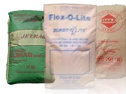
Wide selection of abrasive media sold in bags (55 lb), pallets (40 bags) or super bags (2,500 lb)