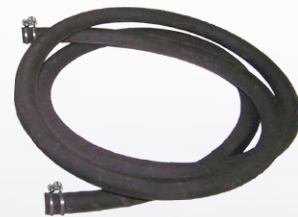
8' sandblasting hose \frac{3}{8} " #601112