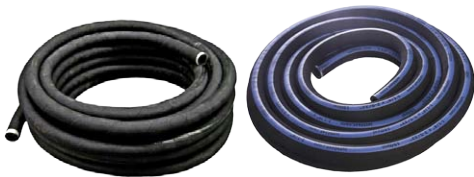
Wide selection of sandblast hoses