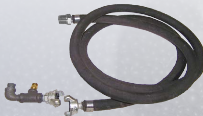
10' sandblasting hose \frac{1}{2} " & connectors upgrade kit # 601116