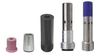
Wide variety of ceramic, tungsten carbide, boron carbide, and silicon carbide nozzles