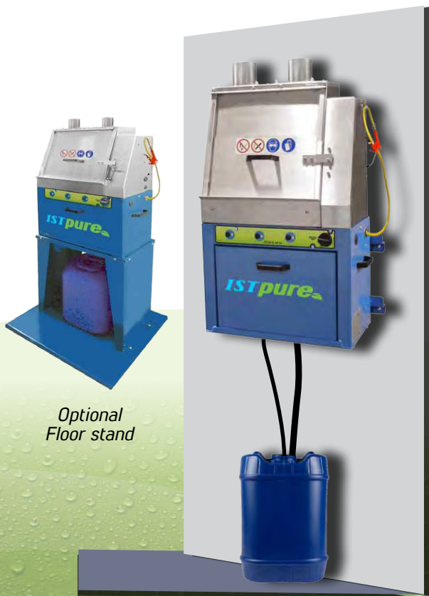
Optional Floor stand

ISTpure's spray gun cleaner GWA 200 is a compact and affordable unit that is suitable for confined spaces and for users with repetitive color or coating changes. Its automatic cleaning station allows to efficiently clean one paint spray gun along with PPS and other disposable cup adapters simultaneously in less than 30 seconds .