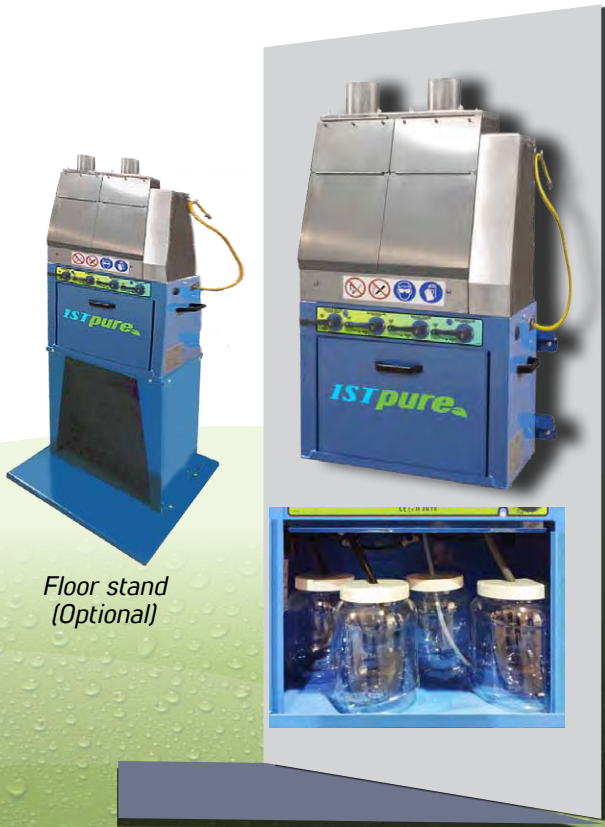
Floor stand (Optional)