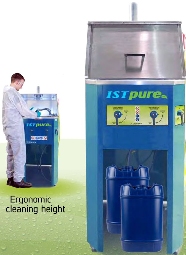
Ergonomic cleaning height

ISTpure's spray gun cleaner GWM 300 is an ergonomic and robust cleaner that is suitable for medium-to-heavy users. Its large manual cleaning station allows to clean efficiently the exterior and the interior of paint spray gun as well as PPS and other disposable cup adapters.