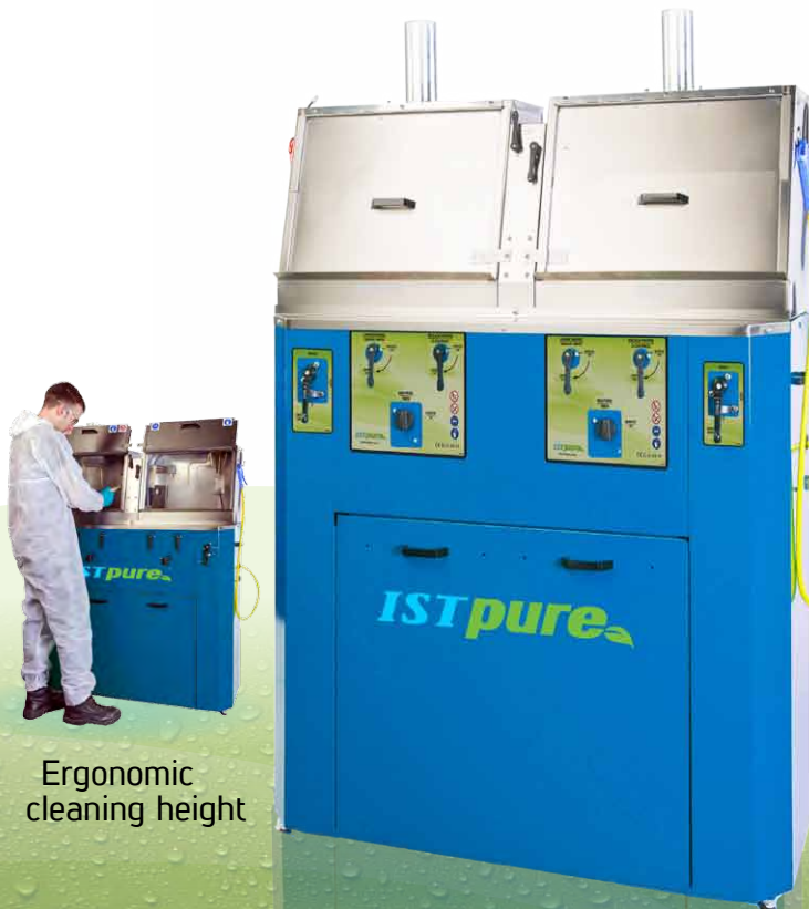
Ergonomic cleaning height

ISTpure's spray gun cleaner GWMA 600 TWIN is a versatile and multi-user dual cleaning station that is suitable for medium-to-heavy users with repetitive color or coating changes. Its dual combined manual and automatic cleaning stations allow to clean efficiently up to two paint spray guns along with PPS and other disposable cup adapters simultaneously in less than 30 seconds using the automatic wash setup or to proceed to a full-wash of disassembled guns using its manual wash setup and tools.