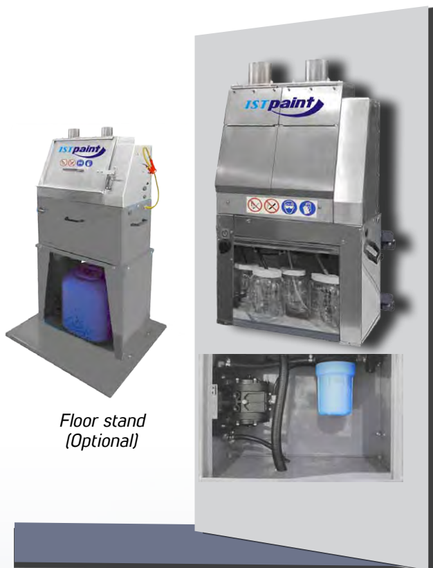
Floor stand (Optional)