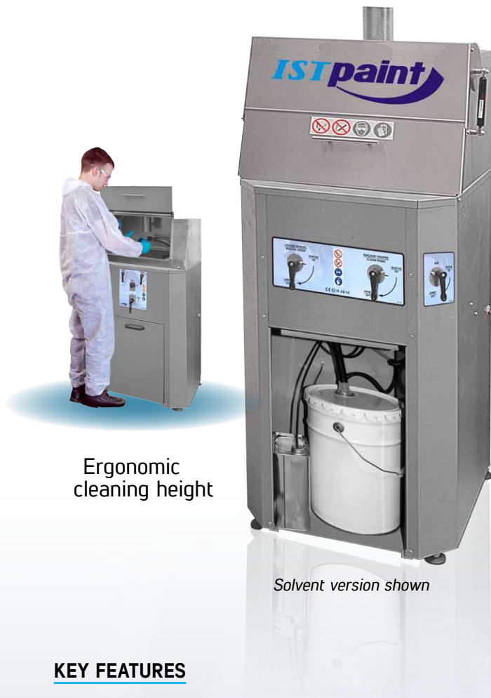
Ergonomic cleaning height