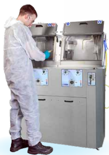
Ergonomic cleaning height