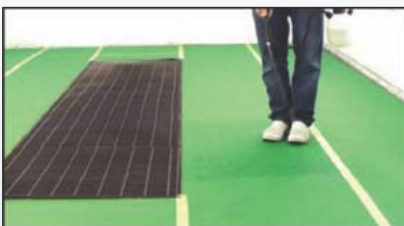
Mist daily with Particle Control